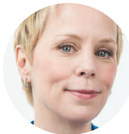
AUGUSTA READ THOMAS

caused by Covid 19 as well as my advancing years (92 years old) have given me time to reflect. What better way than to transfer my thoughts to music. The above titles are a reflection of my mood which assist in the development of the music. It has been my fortune to have a few astute musician/artist friends that always wish to hear my newly completed music. In performing for them in my home before publishing, I was stimulated and challenged by their questions and comments. This came about because I began to compose piano solos with rhythmic changes and extreme overtones that require skill in performing convincingly. They describe them as "Organic, poetic piano solos with layered, full bodied overtones which evoke the mystery and wonder of life."